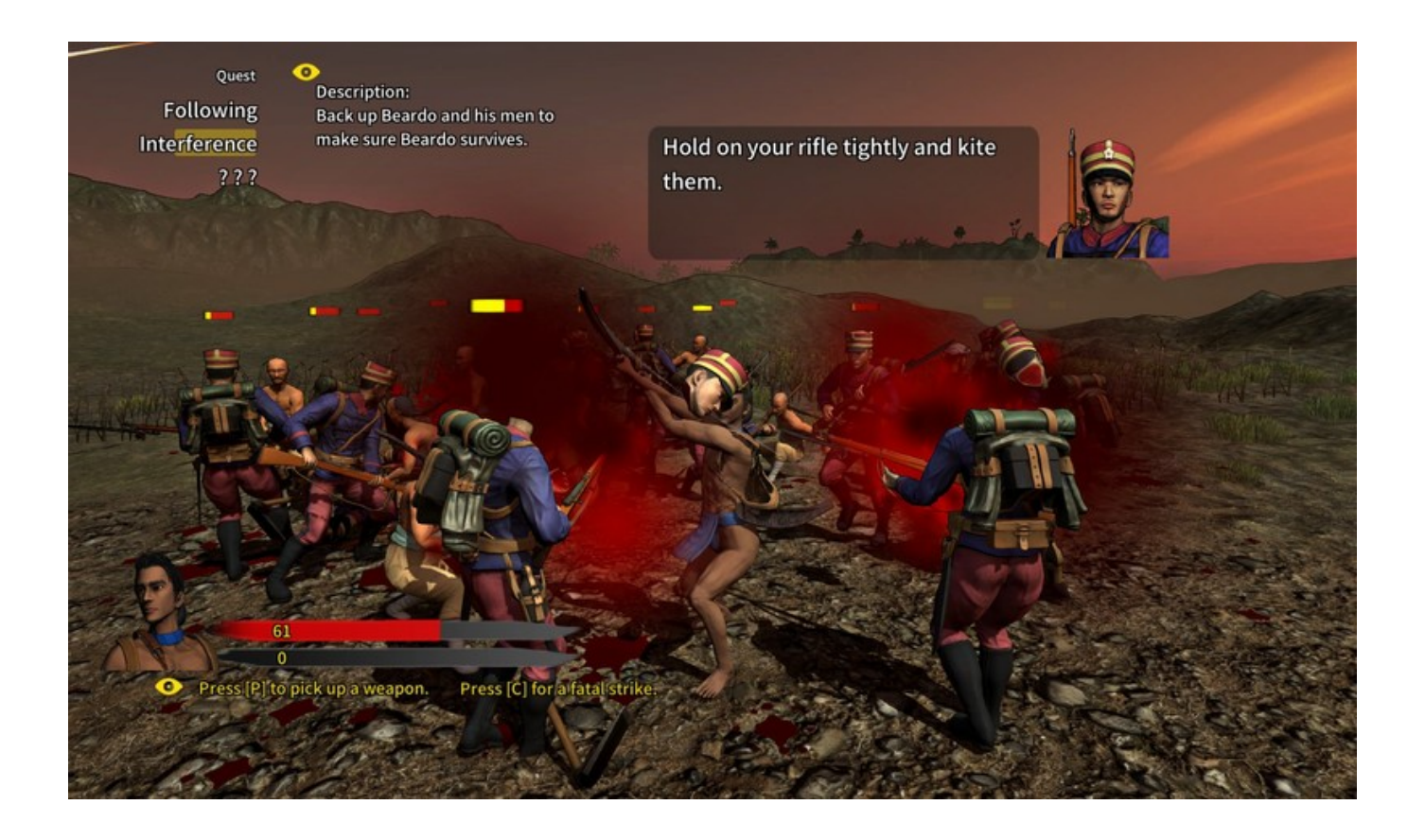
Serment - Contract With A Devil Free Download Crack Serial Key Keygen